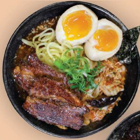
NEW! BEEF KIMCHI RAMEN