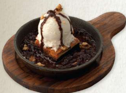
SIZZLIN' BROWNIE A LA MODE