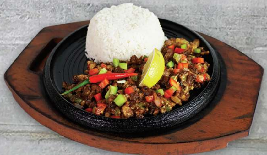
CHICKEN SISIG WITH RICE