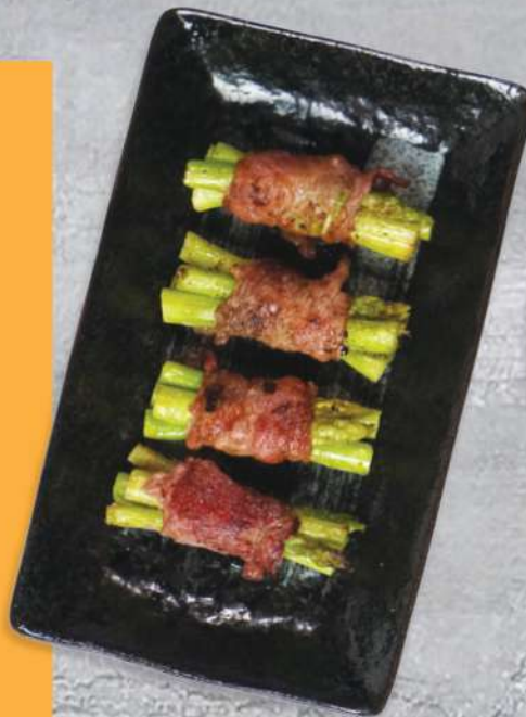
ASUPARA BACON MAKI

A modern Japanese dish of fresh asparagus spears wrapped in honey-glazed beef bacon strips. AED 20.00