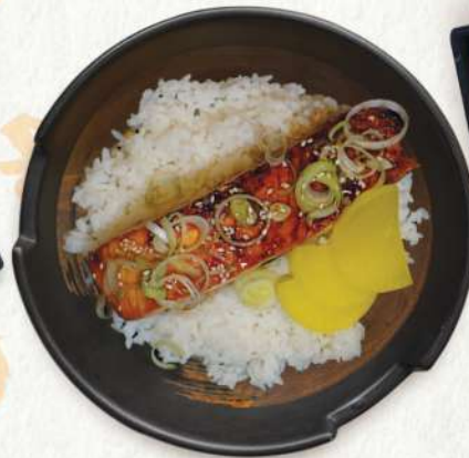
SALMON TERIYAKI DONBURI