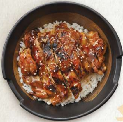
TERIYAKI BOY CHICKEN DONBURI