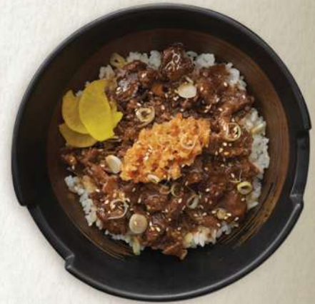
BEEF STRIPS TERIYAKI DONBURI