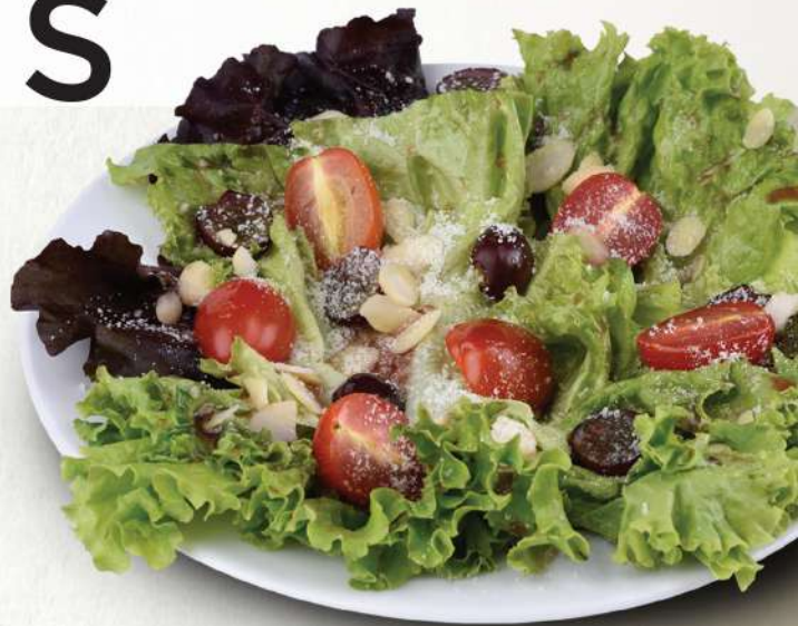
MIXED GREEN SALAD