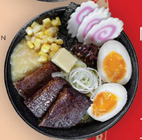
NEW! BEEF SAPPORO RAMEN