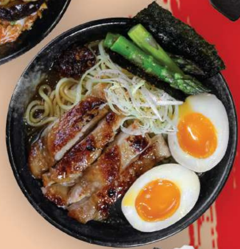
NEW! CHICKEN PAITAN RAMEN