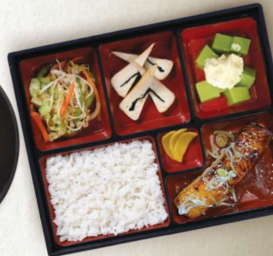
SALMON TERIYAKI BENTO