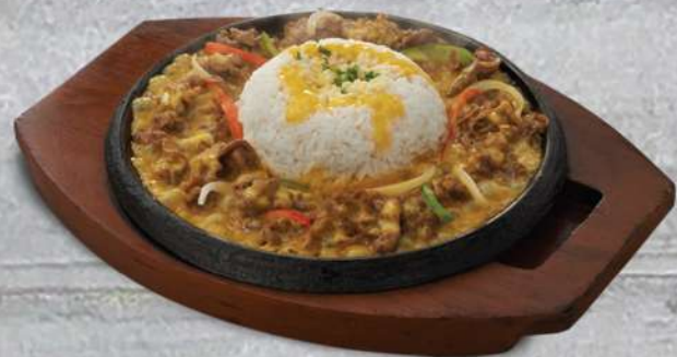
CHEESY BEEF RICE