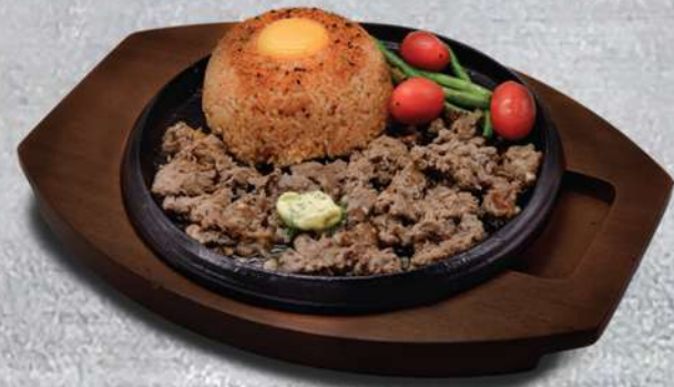
BEEF KIMCHI RICE