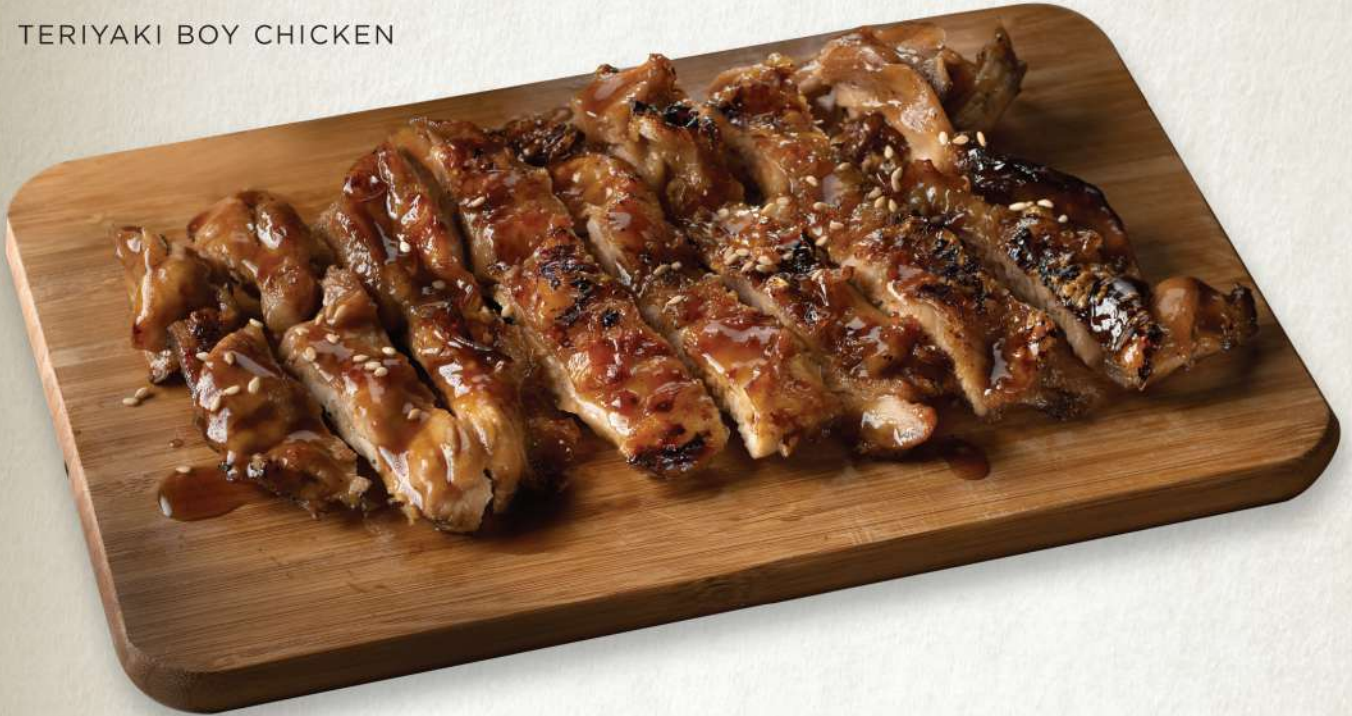
TERIYAKI BOY CHICKEN