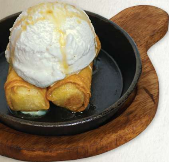
BANANA & JACKFRUIT PIE A LA MODE