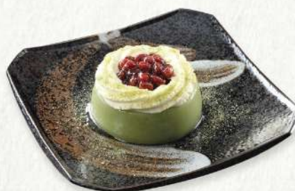
GREEN TEA JELLY WITH RED BEANS